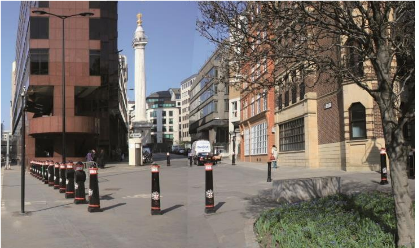
2006 - Lower Thames Street/Monument Street