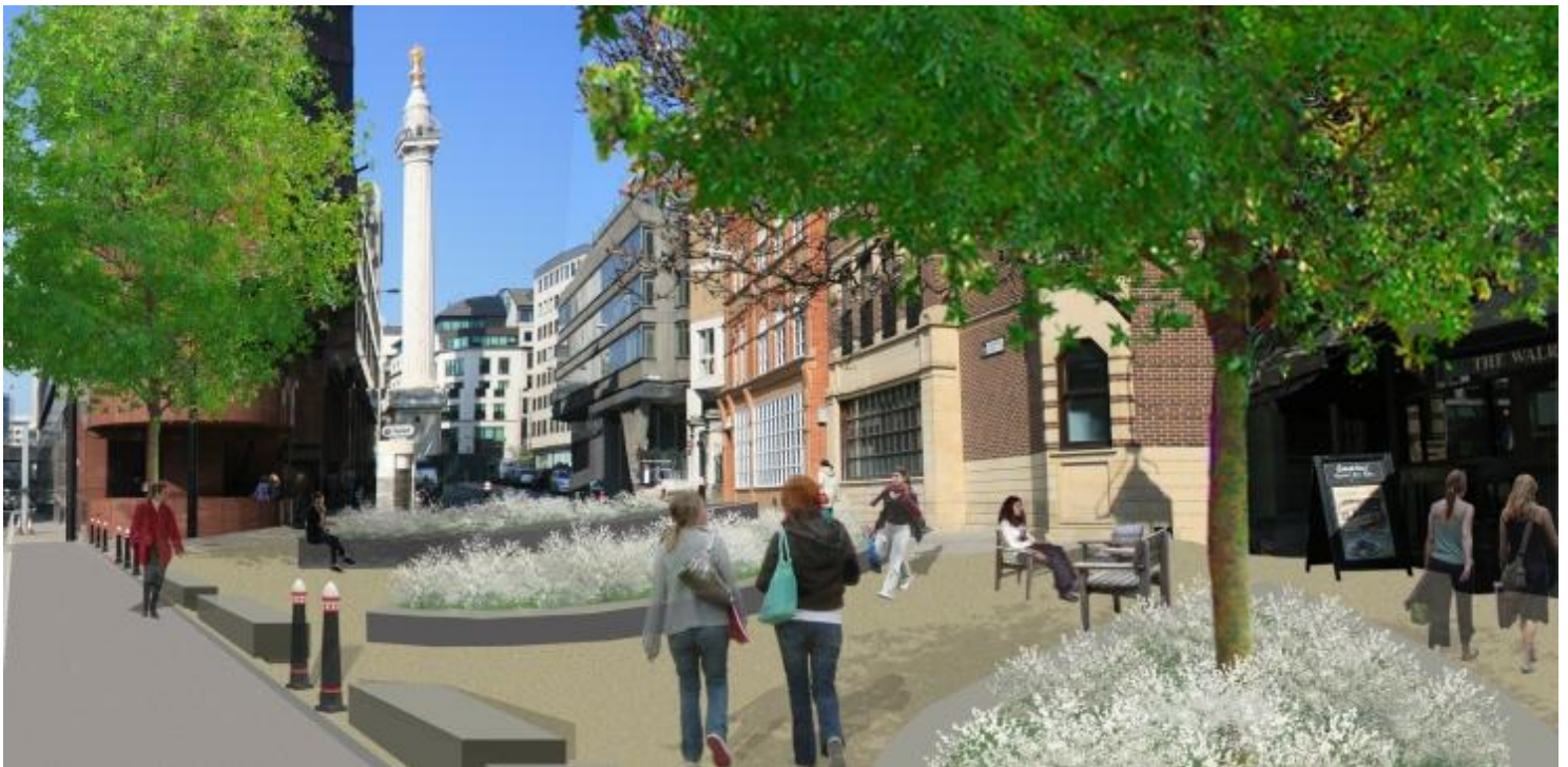
Photomontage of proposed - Lower Thames Street/Monument Street Improvements